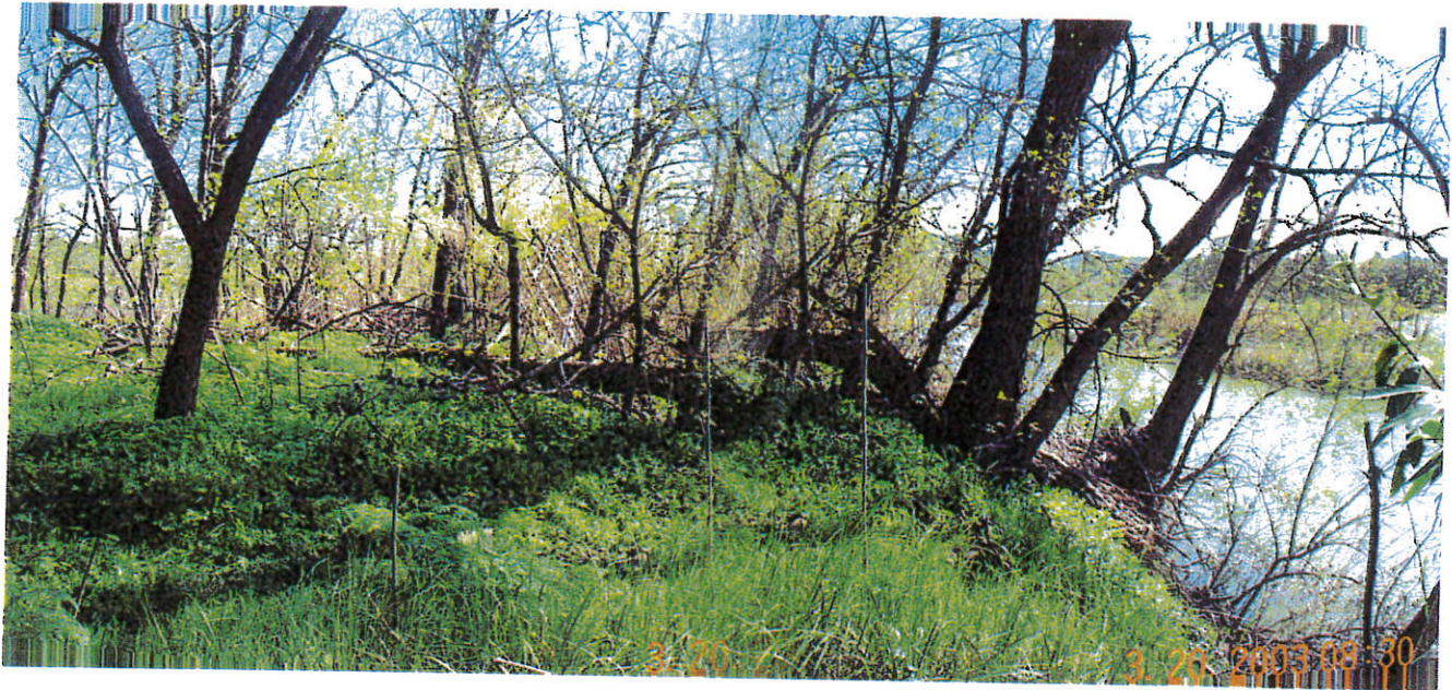
Upstream of Gauntlett Well Field (Application 17121)