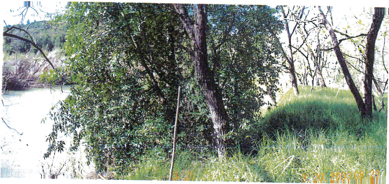
Downstream of Gauntlett Well Field (Application 17121)